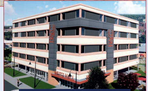
The New RACC Weitz Healthcare Pavilion