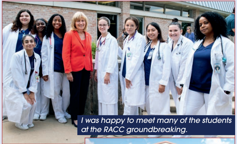
I was happy to meet many of the students at the RACC groundbreaking.

I'm looking forward to returning when the project is completed.